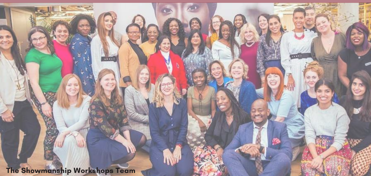
The Showmanship Workshops Team